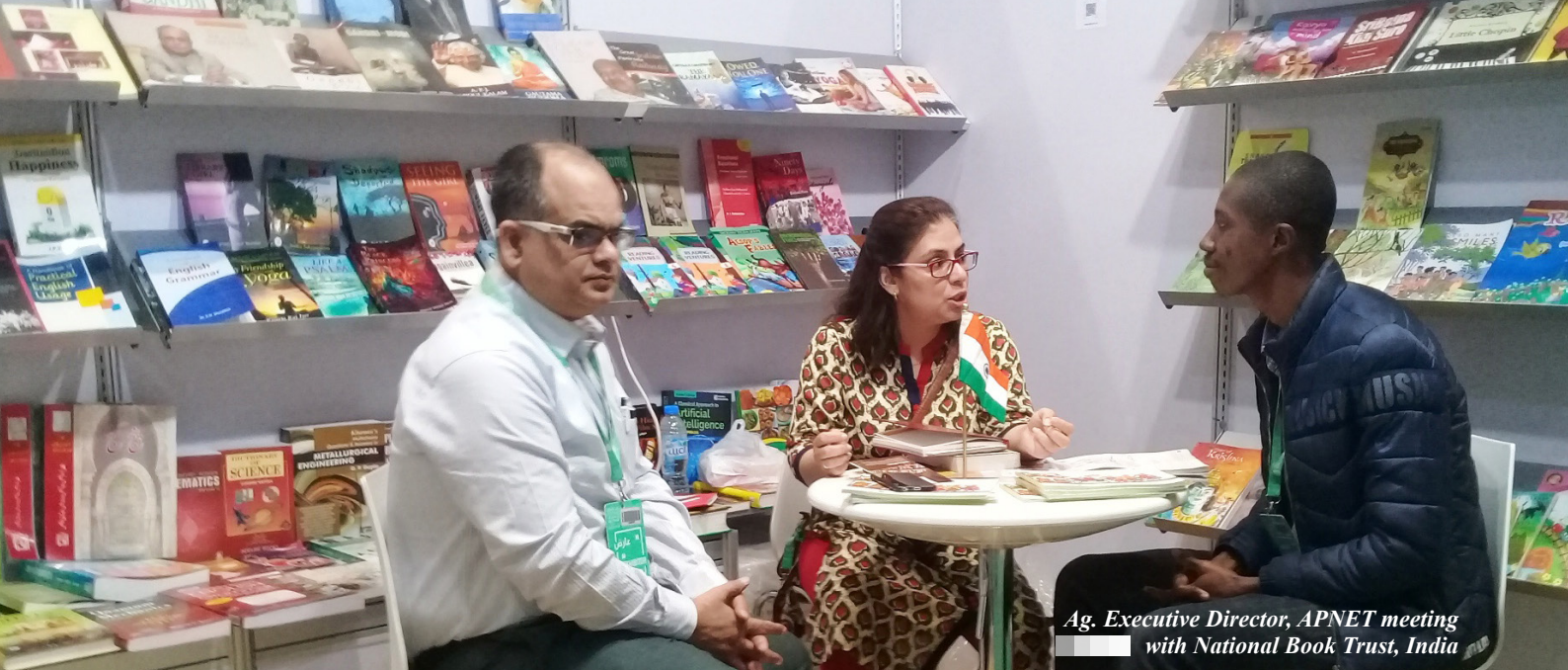
Ag. Executive Director, APNET meeting with National Book Trust, India