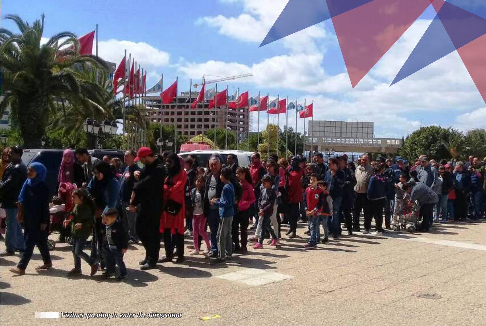
Visitors queuing to enter the fairground